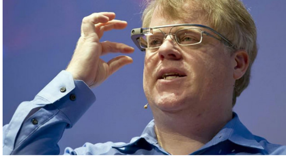
Technologist Robert Scoble

Prescription Glass lenses (that are fashionable ) will make HUD’s less of a novelty and more of a mainstream accessory for everyone”